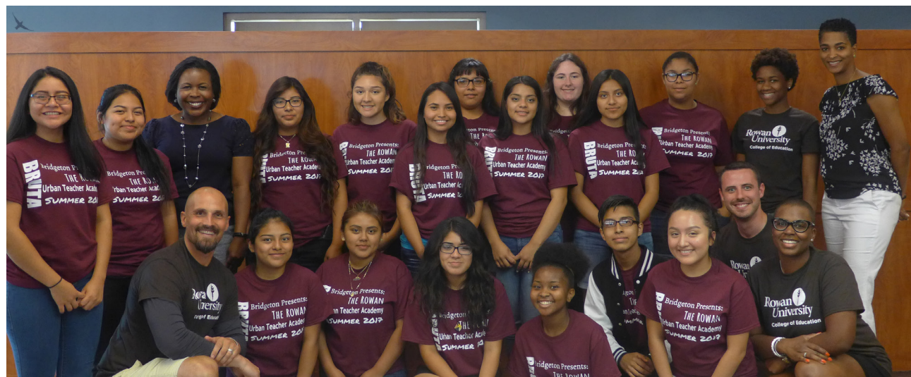
Bridgeton School District RUTA