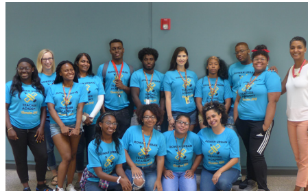
Camden City RUTA

If interested in holding a Rowan Urban Teacher Academy at your school, please complete an Application of Interest which can be found at: go.rowan.edu/RUTA