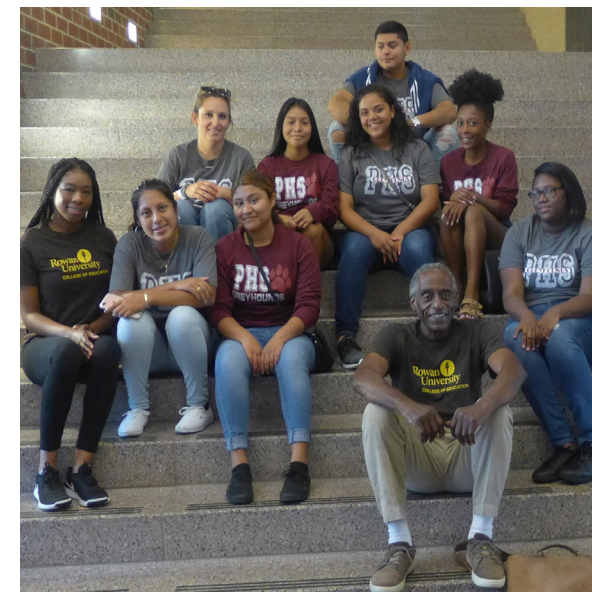
Pleasantville High School RUTA

Inspiring tomorrow's teacher leaders, today