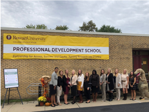
On Oct. 8th, the Sewell's School PDS Banner was unveiled.

The CED welcomed two new PDSs to the Rowan PDS Network. Mantua's Sewell School and Vineland's D'Ippolito Elementary School will join the 9 current Rowan PDSs.