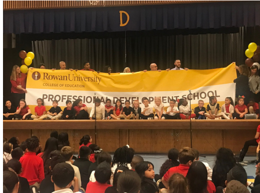
On Oct. 22nd, the D'Ippolito's Elementary Schools PDS Banner was unveiled.